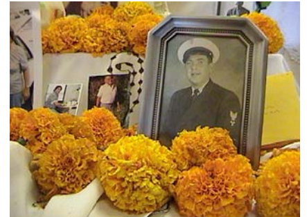
Altars of the Dead in churches honor family loved ones and friends who have died.

'Día de los Muertos,' is a series of prayerful commemorative days for the faithfully departed. This tradition spread into North America and the United States largely from communities with large Mexican and Latin American populations. This special tribute blends celebrations from across several nations and cultures, and draws upon traditions found in many cultures led by the Mexican community. Families often come together after year long preparations. This is a quiet, colorful and solemn occasion, with few festivities. Participants visit and repair the graves of their dearly departed. It is common to light candles, leave offerings of prepared foods, often a favorite meal, and to pray and play music. Private altars are built as focal points for small, private religious observances. Small parties or prayerful wakes can be held in conjunction with these days. Celebrations can sometimes take a fun or humorous tone if the deceased relative was known to enjoy humor. For more see this YouTube video: www.youtube.com/watch?v=bmUf7ix_bag