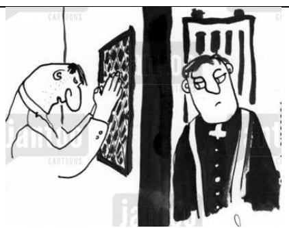
"Bless me Father for I have sinned..."

Most important act, a sincere sorrow for having offended God. There can be no forgiveness of sin if we do not have real sorrow and a firm resolve not to repeat it