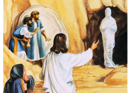
5 th Sunday of Lent Jesus Raises Lazarus from the Dead

The Scrutinies are meant to uncover, then heal all that is weak, defective or sinful in the hearts of the elect [those preparing for the Sacraments of Baptism, Confirmation and the Eucharist]; to bring out, then strengthen, all that is upright, strong and good. The Scrutinies are celebrated in order to deliver the elect from the power of sin and Satan, to protect them against temptation, and to give them strength in Christ, who is the way, the truth and the life.