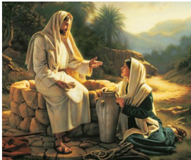
3 rd Sunday of Lent Jesus and Woman at the Well

We are all in need of conversion throughout our lives, so we join with the newly "elect" in the Church in scrutinizing our lives, and pray for the grace to overcome the power of sin that infects our hearts.